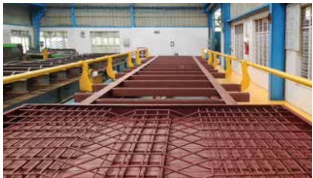
Schwing Weighbridge Platform Assembly – Improved Design