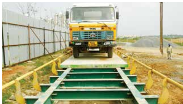
Impact of Axle Loading