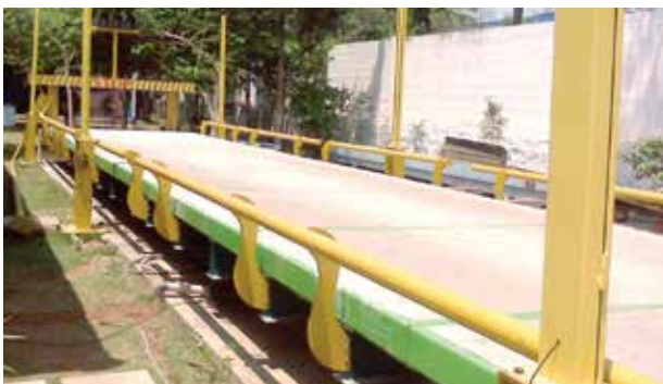
Sandwich Construction For Higher Clc