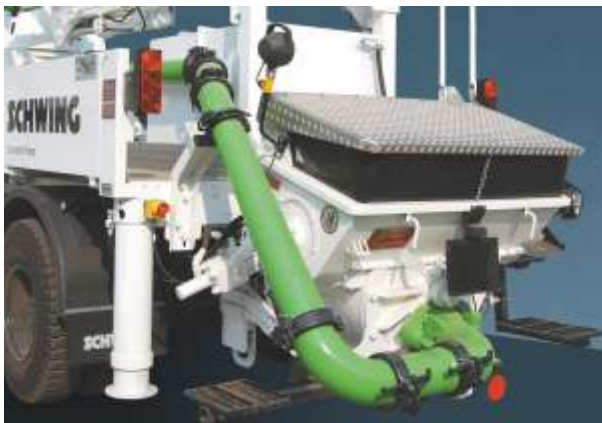
Rock Valve system

Thanks to it's lightweight superstructure and modular design it is possible to mount on a 16 Ton truck that fulfills most of our customer's needs. The compact size of this boom truck makes it usable under bridges, on barges, inside excavation and dam sites. It is the ultimate 'Urban Machine' which can be used to pump many residential jobs with minimum set up time.