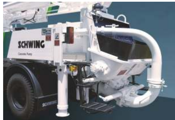
Gate Valve system

The delivery system has options of Flat gate valve / Rock valve system. Flat gate valve is known for its success with tough concrete and Rock valve is known for its pumping characteristics, low wear behavior, rebuilding qualities and safety.