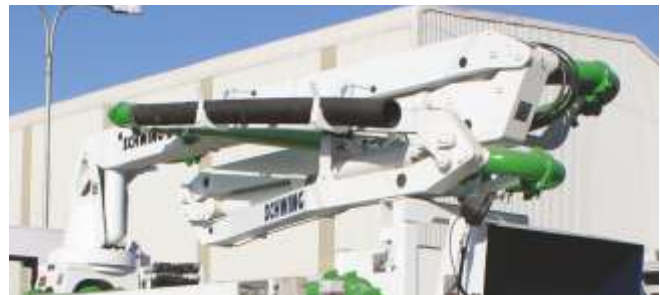
The combined RZ fold